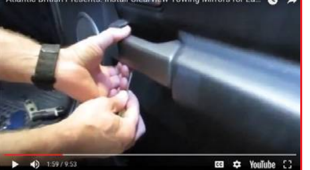
3. Remove the cover on the door panel arm rest using a pocket screwdriver.

4. Remove the 4 screws that are revealed.